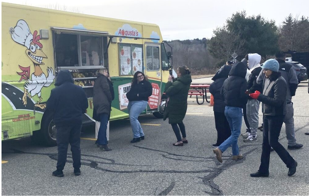
Leasing clients at 144 North Road, in Sudbury, braved the bracing winter weather to enjoy pop-up food truck Augusta's Chicken on the Road .