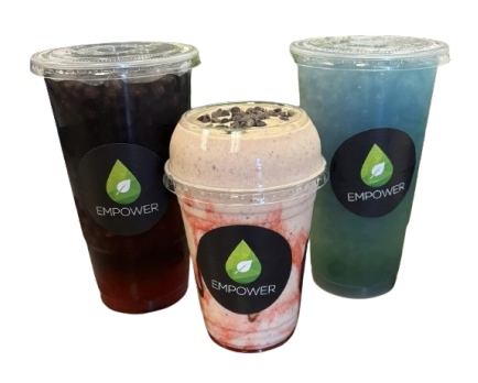
10% Off Empower Woburn 400 West Cummings Park, Suite 1975, Wohurn

Cummings leasing clients are invited to claim a 10 percent discount at Empower Woburn 's <u>newly renovated</u> Retro Café. This sleek space offers a classic American feel, complete with a retro juke box, as well as an expanded