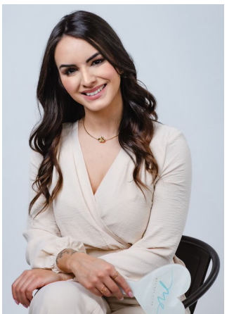
10% Off in June <u>Monique Ellen Aesthetics</u> 400 West Cummings Park, Suite 1200, Woburn

selection of teas, shakes, smoothies, coffee drinks, and baked goods. Call 781-365-9932 or stop in to learn more.