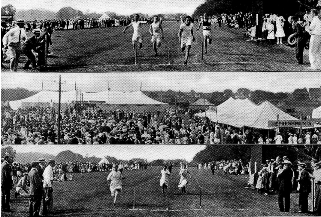
EMPLOYEES' FIELD DAY

Cummings Center's "Live, Work, Play" vibe predates the modern-day business campus by more than a century. First opened in 1905, The Shoe provided factory workers with access to nearby employee housing as well as a clubhouse, athletic fields, gardening plots, and more.