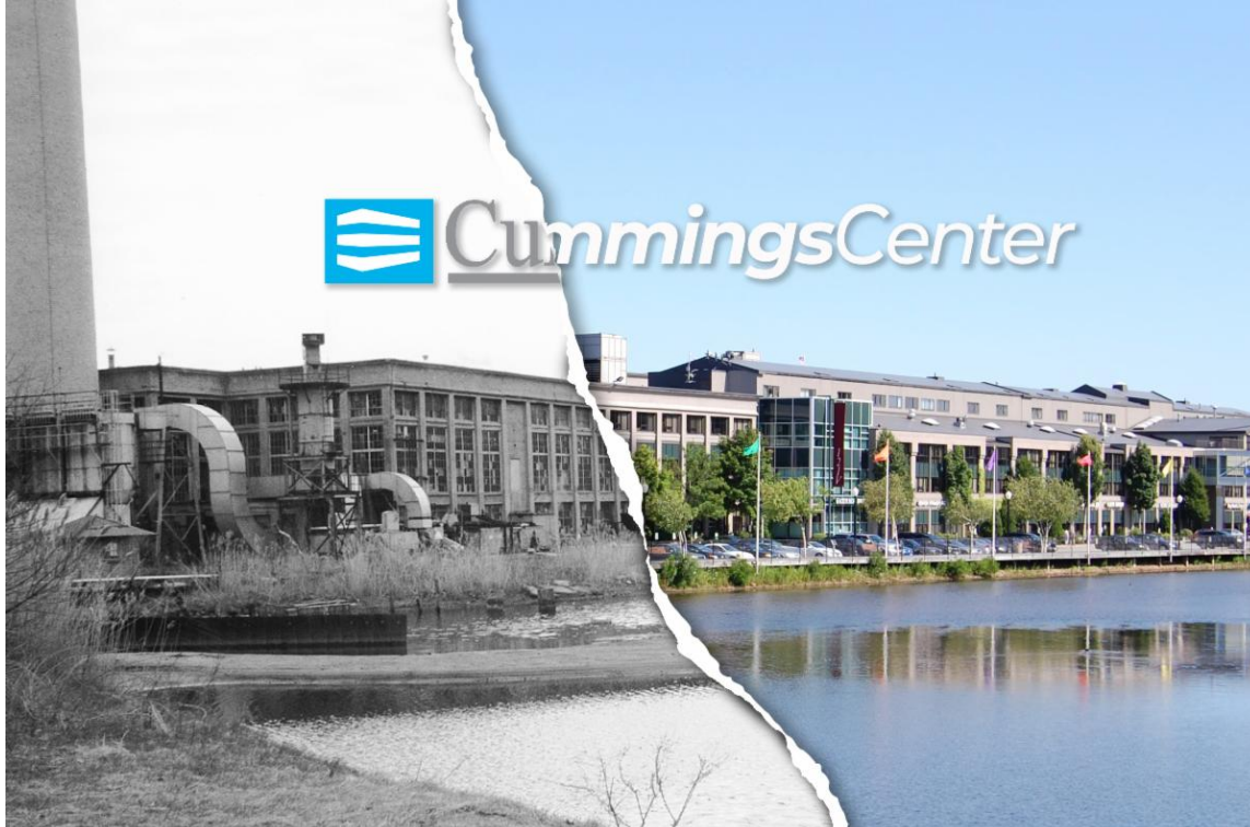
900 Cummings Center, before and after